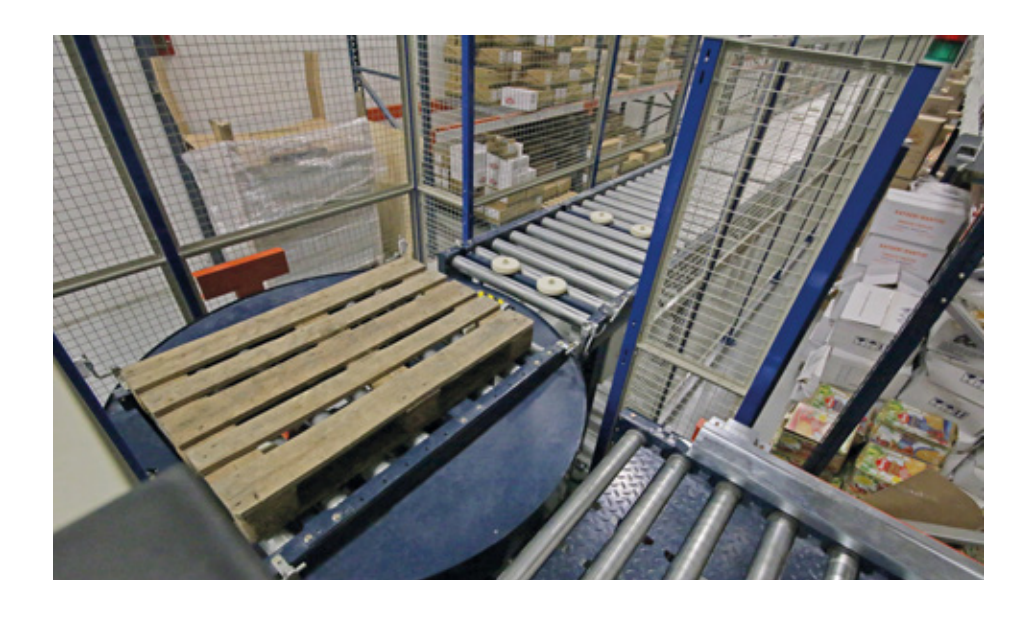
The conveyor at the Firat Food installation is 138' long and runs at a speed of 33 ft/min