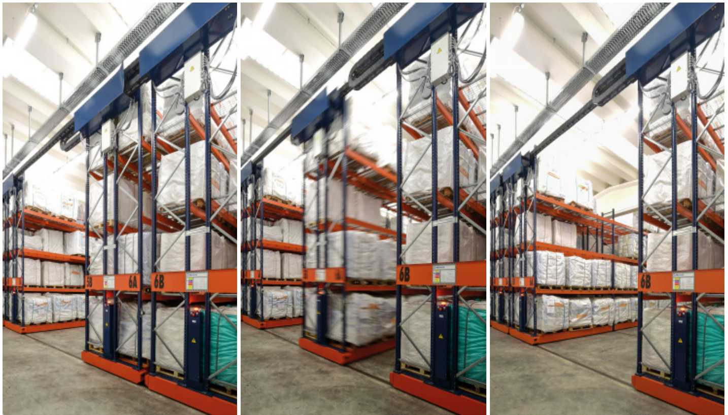
The images show how the Movirack mobile pallet racking system works

The block of Movirack mobile racking, which occupies an area of 6,781 ft 2 can store 1,528 pallets of 35" x 47" with a maximum weight of 1,100 lbs each